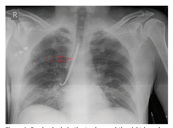
Figure 1. Foreign body in the trachea and the right bronchus detected with X-ray.

Vital signs were normal. The chest X-ray revealed a metal 11-cm-long foreign object in the distal part of trachea and right main bronchus (Figure 1). The patient was scheduled promptly for rigid bronchoscopy under general anaesthesia, without endotracheal intubation. In case of failed endoscopy, as a backup plan tracheotomy and the extraction of the FB thro-