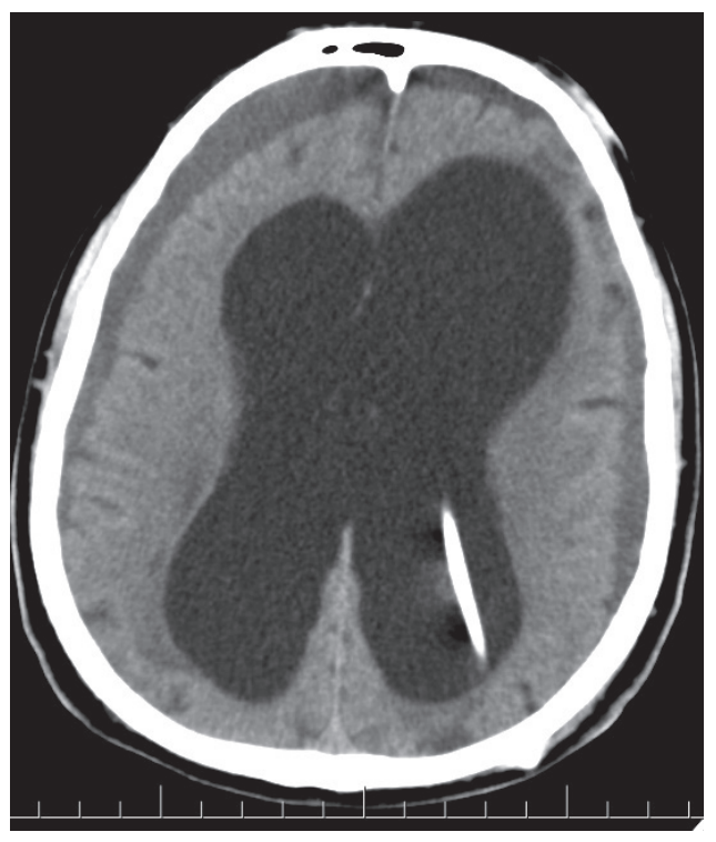
Figure 3. Postoperative cranial axial CT scan taken after ventriculoperitoneal shunting reveals bilateral frontoparietal subdural hematoma -the larger one being under the craniotomy on the right side- and the shunt catheter inserted from the left Frazier point.

ver, hydrocephalus still existed, and the patient's GCS did not improve alongside these radiological findings. A medium pressure ventriculoperitoneal shunt was inserted from left Frazier point and the GCS of the patient improved immediately after the placement of ventriculoperitoneal shunt. This time, however, bilateral frontoparietal subdural hematoma -the larger one being under the craniotomy on the right sidewas observed under the craniotomy incision [Figure 3]. After a week of close observation, hematoma resolved spontaneously [Figure 4] and the patient was discharged from hospital with a GCS of 14.