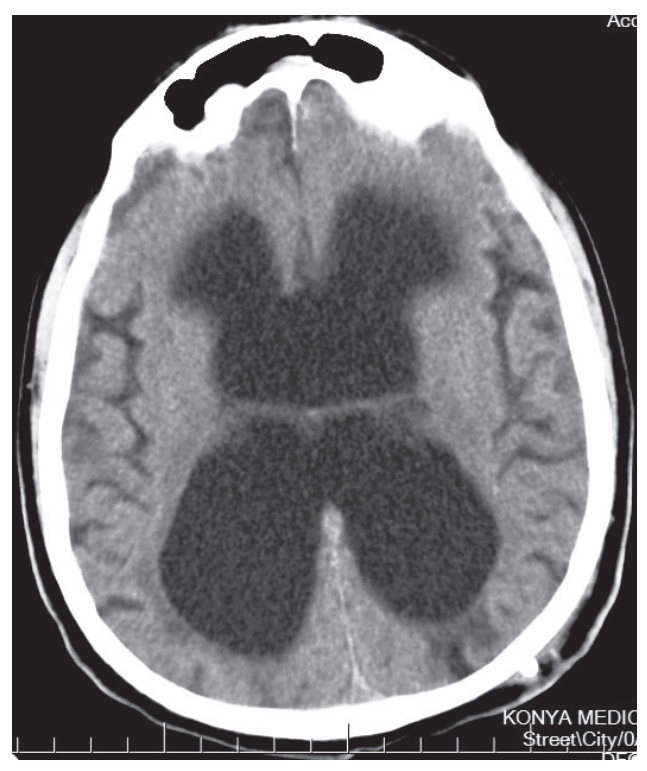
Figure 2. Postoperative cranial axial CT scan revealing a moderate decrease in ventricle sizes and a gross-total excision of arachnoid cyst.