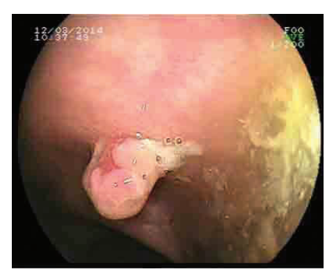
Figure 1. Rectal polyp on endoscopic examination.