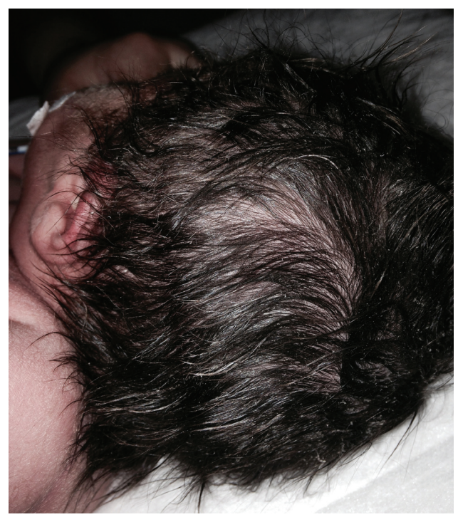
Figure 2. Encephalocele from the lateral view.

distress characterized by severe decelerations of fetal heart beats was noticed. An emergency caesarean section was performed. The baby was born with a 3x4 centimeter (cm) temporo-parietal encephalocele. The lesion was covered with normal skin (Figure 1 and 2). The Apgar scores were 7 and 9 at 1<sup>st</sup> and 5<sup>th</sup> minutes respectively.