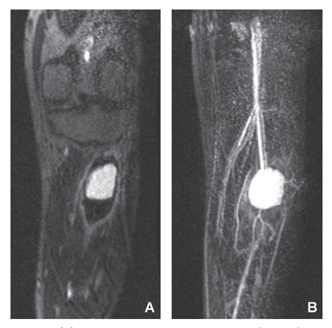
Figure 1. (A) Magnetic resonance angiography of the left leg shows the infra-popliteal localization of the aneurysm; (B) segmental obstructions of the left tibioperoneal trunk.

A 32-year-old male presented with the complaints of claudication in the left lower extremity and with a pulsatile mass on the backside below the left knee level. The patient did not have an additional disease but had intravenous drug abuse. The physical examination revealed normal heart sounds. The left popliteal artery was palpable, however pulsations of left dorsalis pedis and tibialis posterior could be palpated deeply. Magnetic resonance angiographic examination showed aneurysmal dilatation of the popliteal artery (Figure 1) below the knee level. On systematic examination any pathological finding like fever, hyper-, and hypotension, and arrhythmia were not detected. The parameters such as blood counts, CRP and sedimentation rate were entirely normal at the time of referral.