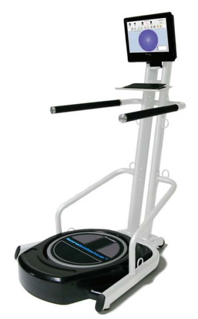
Figure 1. Korebalance Balance System

With the advances in technology, various balance evaluation systems have been introduced in addition to the current balance assessment. Examples of balance assessment systems include posturography, computerized balance trainers, Korebalance® systems and three-dimensional systems. Although these systems are referred to by different names, their working mechanisms are very similar. They all have built-in features that allow acquisition and recording of data based on body sways tested under static and dynamic conditions on a balance platform<sup>4</sup>.