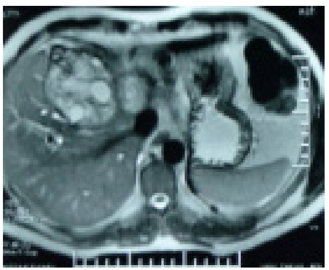
Figure 2. Magnetic resonance imaging (MRI) shows the liver cyst hydatid content in axial section.

shows the liver cyst hydatid content in coronal section and Figure 2 in axial section. Figure 3 shows the rupture of cyst contents into the biliary tract in magnetic resonance cholangiopancreatography (MRCP) image. Acute necrotizing pancreatitis was detected with ultrasonography (USG) and computed tomography (CT) in 3 cases, and necrotizing pancreatitis (developing after ERCP) in one patient after acute edematous pancreatitis. In Figure 4, an effusion extending from the peripancreatic area to the right perirenal fascia due to necrotizing pancreatitis was detected.