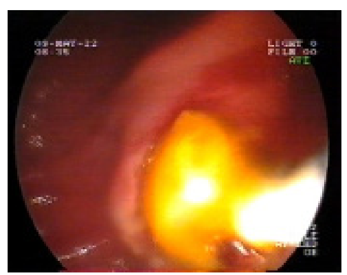
Figure 6. The outflow of cyst hydatid germinative membranes drained after endoscopic sphincterotomy is demonstrated.