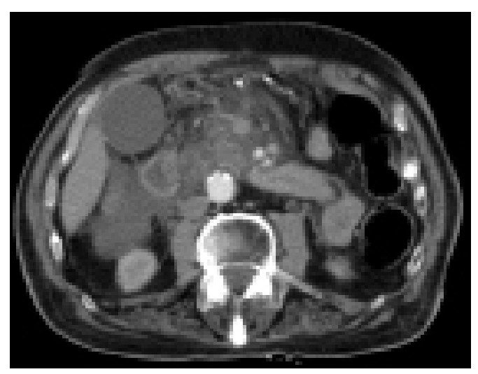
Figure 4. An effusion extending from the peripancreatic area to the right perirenal fascia due to necrotizing pancreatitis was detected.

When all patients are diagnosed Andazol® (Albendazole to, Biofarma, Istanbul, Turkey) medical treatment (400 mg BID) was initiated. Patients underwent laparoscopic cystectomy after the necrotizing pancreatitis clinic subsided. Intraabdominal necrosis areas were not intervened before 4 weeks. Minimally invasive methods such as percutaneous drainage were applied after encapsulated areas were encapsulated.