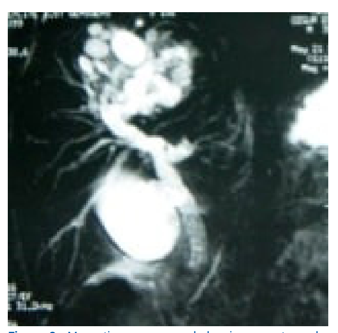
Figure 3. Magnetic resonance cholangiopancreatography (MRCP) shows the rupture of cyst contents into the biliary tract.