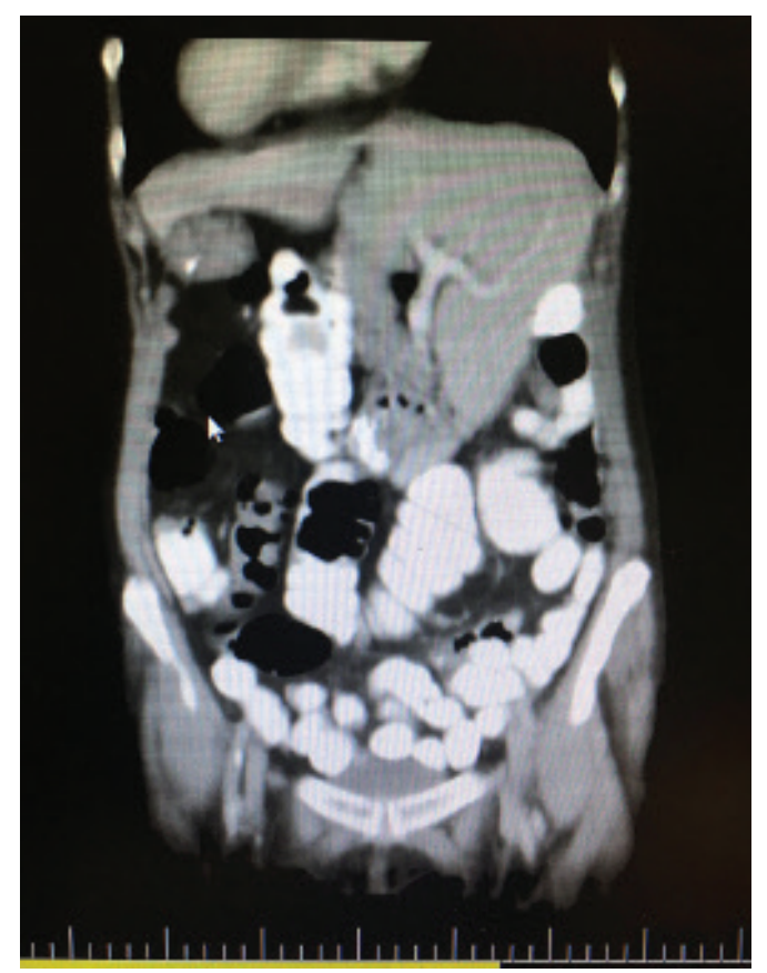
Figure 1. General thoracal and abdominal anatomoy of the patient on CT scan.

reported biliary injury in cases of LC in patients with SIT can be percieved as an evidence of these conclusions. The exceptionality of these cases may prevent an injury by referring the surgeon to be more careful. On the other hand, the low number of reported cases may be the reason of the absence of reported biliary injury. It does not seem to be possible to clarify this point of issue with the current data.