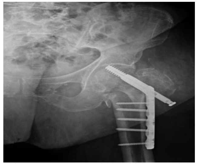
Figure 7. Post- operative month 2 lateral diclocation in yhe lag screw