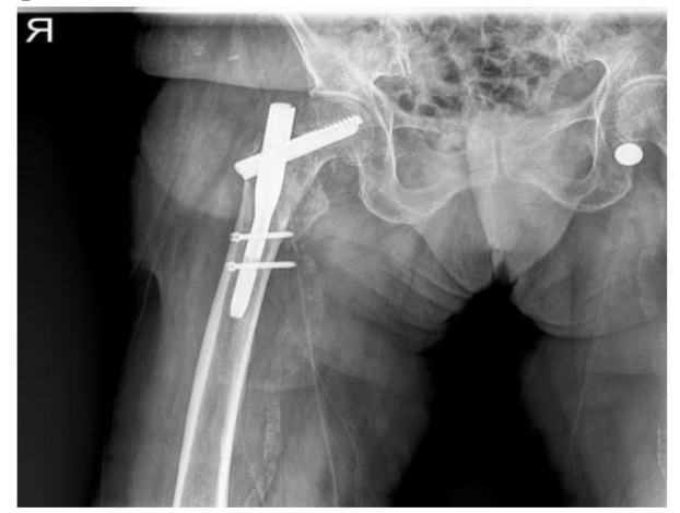
Figure 2. 83 Y, 31.A2.1 trochanteric fracture, Early postoperative, PFN fixation

scales and the Salvati-Wilson clinical scores (SWS) demonstrated that the clinical score was statistically significantly higher in the group with better reduction in patients with PFN and DHS( (p<0.05) (Table 4).