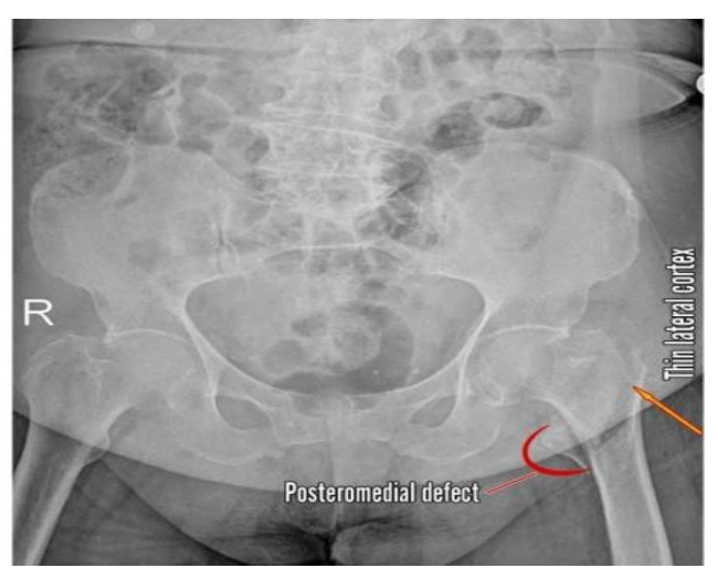
Figure 5. Pre-operative trochanteric femur fracture AO/OTA type A2.1 thin lateral cortex