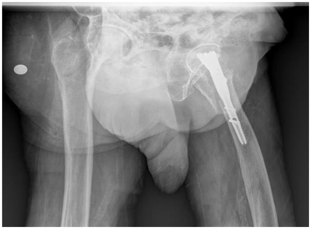
Figure 3. Early post- operative lateral radiography