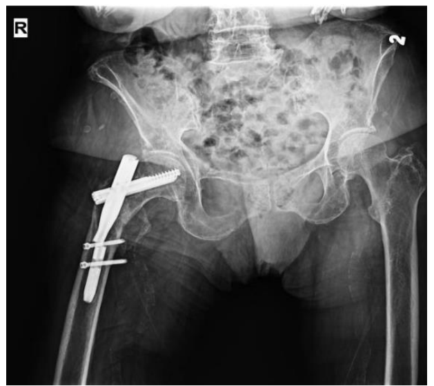
Figure 4. Post- operative month 4. nail was broken