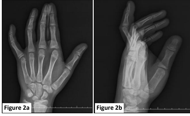
Figure 2 a-b: Preoperatif x-rays.

There was no distal neurovascular deficit. X-rays were suggestive of dorsal dislocation of proximal phalanx of the left index finger (Figure 2 a-b).