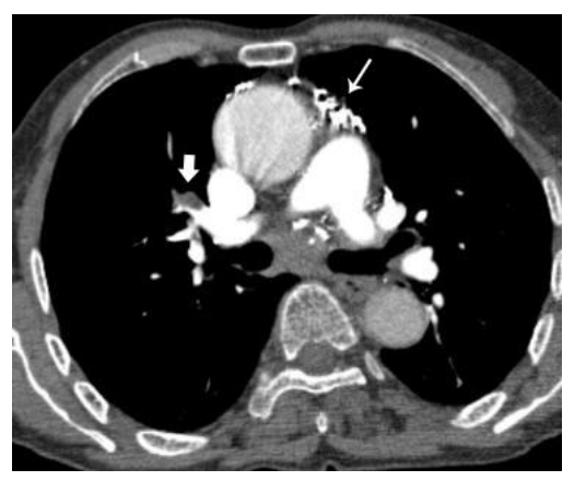
Figure 1. Axial image of pulmonary CT scan shows an acute pulmonary embolus that affects the distal part of right pulmonary artery (thick arrow). Also, there are multiple venous collaterals on the mediastinum (thin arrow).

A 85-years-old female patient presented with dyspnea. Physical examination was unremarkable. To exclude pulmonary tromboembolism, pulmonary computed tomography (CT) angiography was performed by 64-detector row CT. There was a partial trombus in the distal part of right pulmonary artery (Fig. 1).