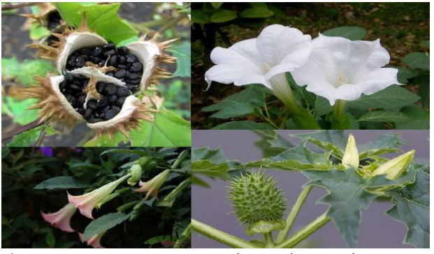
Figure 1. Datura Stramonium plantand its seeds

High doses of DS may cause anticholinergic toxicity due tocontents of toxic substances like atropine, scopolamine, and hyoscyamine (2). The plant is 20-100 cm high with 7-14 branches, having 3-4 cm green toothed leaves that contain brown-black seeds with trumpet shaped flowers in a variety of colors (3).