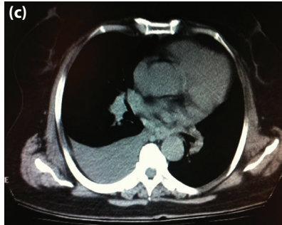
Figure 2. (a-c) Thoracic computed tomogram.