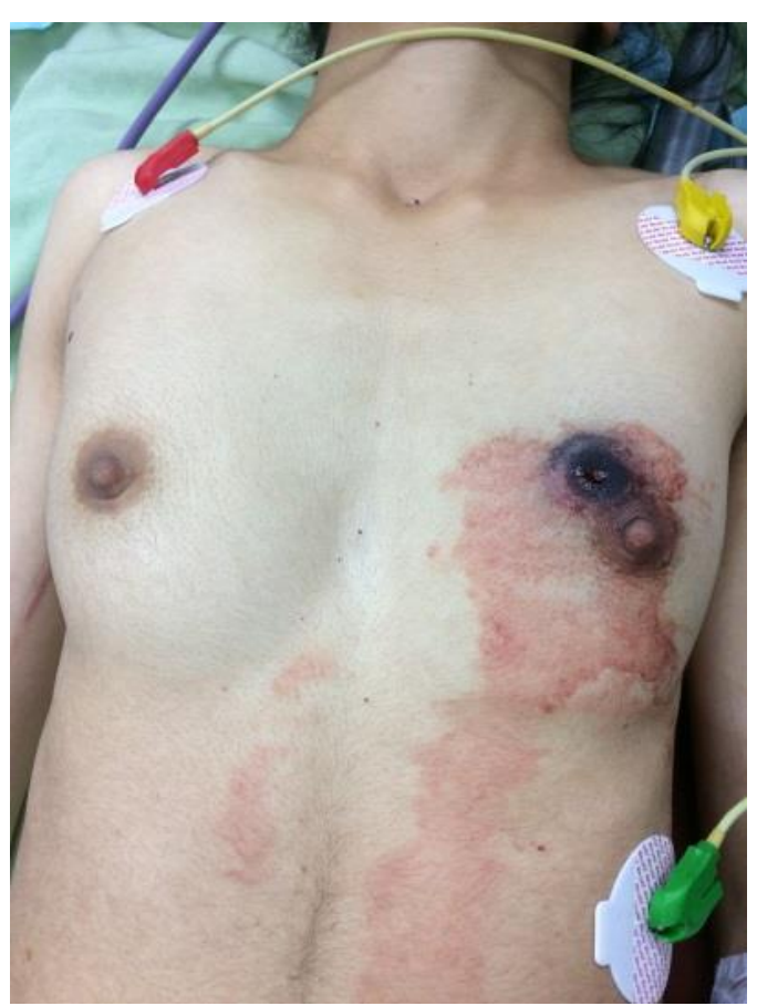
Figure 1. Morphological view of the penetrating firearm wound. Note the contact muzzle stamp around the bullet entry hole.

Kafkas J Med Sci 2018; 8 (Ek1)80-85 DOI: 10.5505/kjms.2017.05945