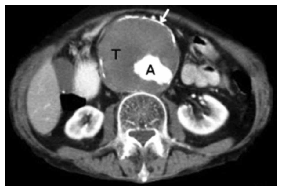
Figure 1. Seventy-one-year-old male presenting with abdominal pain and nausea was subsequently diagnosed with thrombosed abdominal aortic aneurysm. Contrast enhanced preoperative tomography. Axial plane at the first lumbar vertebra shows thrombosed abdominal aortic aneurysm (T), the shaggy aorta (A) and calcified borders (white arrow).

therapy with 100 IU/kg enoxaparin once a day was initiated. At the tenth day, infection signs regressed, pulmonary function was slightly better (Peripheral oxygen saturation: 92% with two l/min nasal oxygen therapy, forced expiratory volume in one second: 45%, forced expiratory volume in one second/forced vital capacity: 0.68). Cardiovascular surgeons planned endovascular abdominal aortic aneurysm repair.