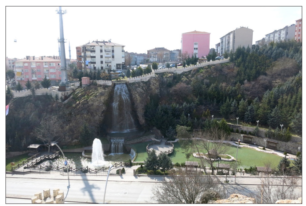
Figure 4. The Waterfall in front of the Estergon Cultural Center.

The Cultural Center is composed of 3 different parts. The structure of the castle serves as a commercial center on the ground floor, an ethnographical museum on the second level, and restaurant/observation terrace on the last level. On top of the main castle structure the "kümbet" portion is constructed. This Kümbet is used as a place where recreational gatherings are held. The area between the castle and its fortifications extending further up to the hill is designed as Asian gardens. Some restaurants are also present in these gardens constructed in traditional Turkic styles.