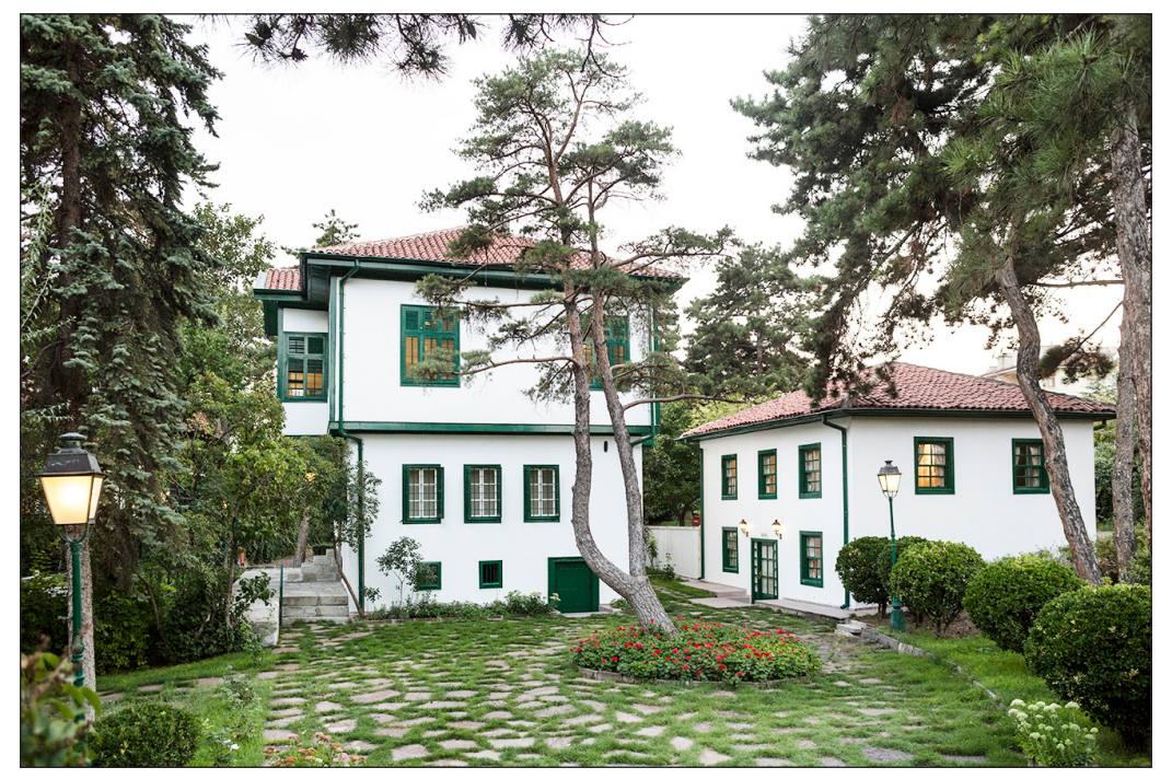
Figure 1. Koç University Vehbi Koç Ankara Studies Research Center (VEKAM): One of the last traditional vineyard houses in Keçiören.

According to the Jansen Plan (1932), the typical designs of the vineyards and gardens were to be protected. Up until the 1950s the district managed to preserve its characteris-