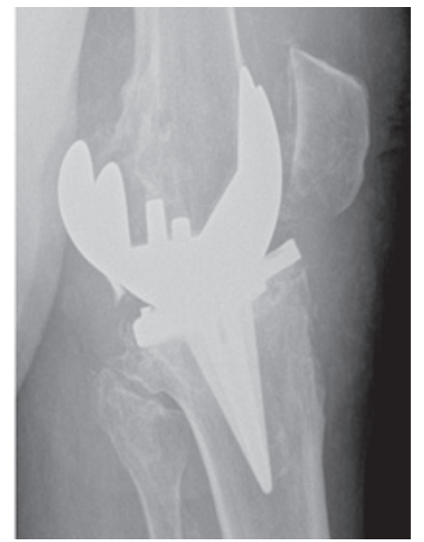
\hbox{Figure 3: Roentogram of a 75-year-old male patient who underwent total knee arthroplasty 5 years ago. } \\