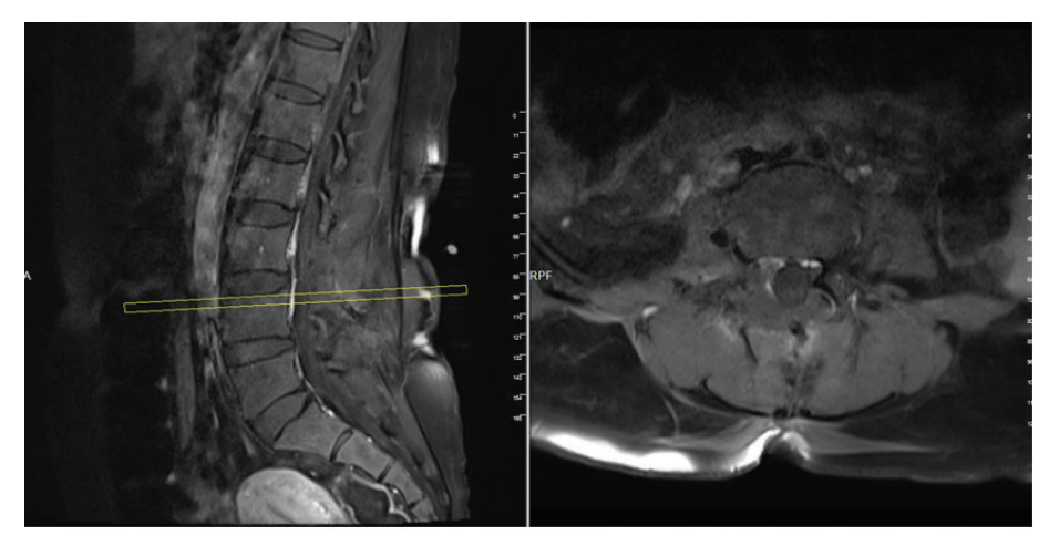
FIGURE 3: Postoperative MRI; no enhancing tumoral lesions.

anatomical structures. Also, the operation should be preferred in the presence of intraoperative neuromonitoring to prevent intrathoracic neural tissue damage.