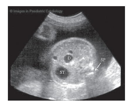
FIGURE 2: Duodenal atresia at 28 weeks of gestational age. The transverse scan of the abdomen (ST: stomach; D: dilatated duodenal bulb; SP: fetal spine) (Prenatal diagnosis of congenital anomalies, Todros T, et. al - Images Paediatr Cardiol, 2001).