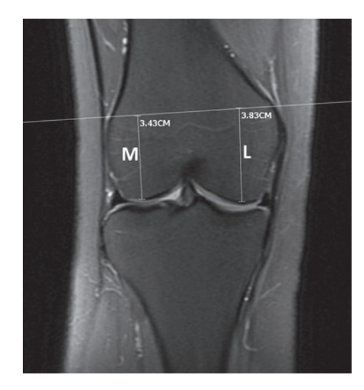
Figure 5: Coronal PD-SPAIR image. Medial (M) and lateral (L) condylar lengths.