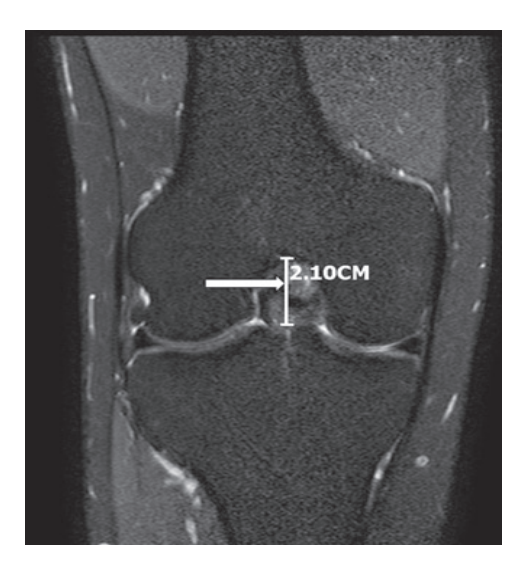
Figure 4: Coronal PD-SPAIR image: Intercondylar notch length (arrow).