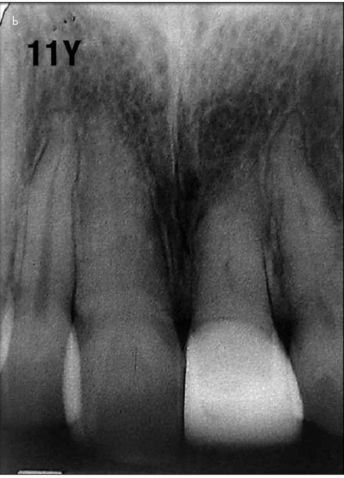
Figure 3. a, b. 11-year follow-up. Dental papillae maintain their shape and height, and healthy periodontal tissues are observed with normal alveolar bone and crest, both in width and height (a) Radiographic image shows normal periradicular tissues (b)

Two years after the procedure, the premolar responded positively, both to thermal and electric pulp tests. Radiographically, the root canal looked narrower with apposition of hard tissue, and the root had developed a distal curvature. There were no signs of periradicular or periodontal disease (Figure 2a). The appearance of the tooth was restored with a ceramic crown (Figure 2b).