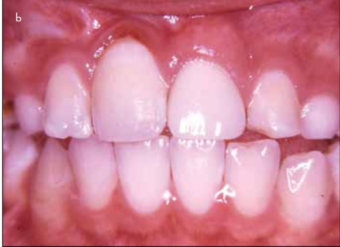
Figure 2. a-c. 2 years 3-months follow-up. Radiographically, there is absence of periodontal or periapical pathosis, but presence of lamina dura and hard tissue formation in the root canal (a) 2 years 3-months follow-up. Clinical picture with a ceramic restoration. Papilla and periodontal tissues look healthy (b) 4-year follow-up. Radiographically, periradicular tissues are normal and show no signs of inflammatory external root resorption. Hard tissue apposition seems to continue in the root canal space, which usually indicates vital tissue in the root canal (c)

of the mandibular premolar was performed, also using a local anaesthetic without vasoconstrictor, to minimise the effect on pulpal blood flow to the donor tooth. An intrasulcular incision was made around the mandibular premolar, which was then carefully luxated to avoid excessive rotation of the tooth and consequent damage to Hertwig's epithelial root sheath.