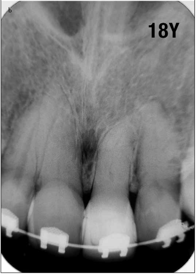
Figure 4. a, b. 18-year follow-up. Patient has undertaken orthodontic treatment, and the transplanted tooth has been moved without damage to the periodontal tissues (a) Radiographically, there is no periradicular pathosis, the periodontal ligament space has normal width, and there are no signs of inflammatory external root resorption (b)

Four years after autotransplantation, there was a minimal positive response to cold and electric pulp tests, the canal lumen had further narrowed radiographically, the bone crest height was within normal limits, and there were no signs of pathosis. A new composite resin veneer was placed on the tooth at this appointment (Figure 2c). At the 11-year follow-up visit, little change was evident relative to the 4-year visit (Figure 3a-b).