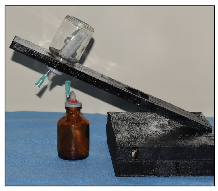
Figure 2. Custom made device to simulate maxillary and mandibular arch

5-ml syringe with a 27-gauge side-vented needle (SS White, Lakewood, New Jersey, USA) was used. The needle was placed