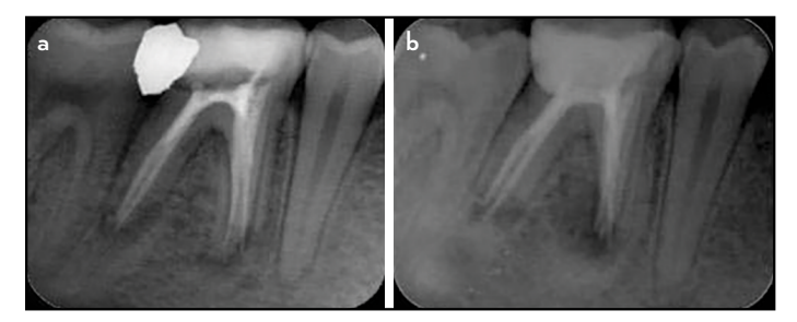
Figure 2. a-b. Images of a mandibular right first molar following endodontic treatment. The tooth was symptomatic at the follow-up appointment and both roots were classified as unsatisfactory healing. (a) The post-operative radiograph indicated periapical radiolucency in both roots. The mesial root revealed perforation of the apical third. (b) The 3-year follow-up radiograph showed that periapical radiolucency was still present in the distal root, with signs of external inflammatory root resorption. The periapical radiolucency in the mesial root increased in size

odontitis. Moreover, the root filling of each root was assessed in terms of the apical extension and density of the filling materials. When a root had more than one root canal, the canal with the worst root filling quality was considered. Table 2 shows the categories for each technical parameter in which a root filling could be classified.