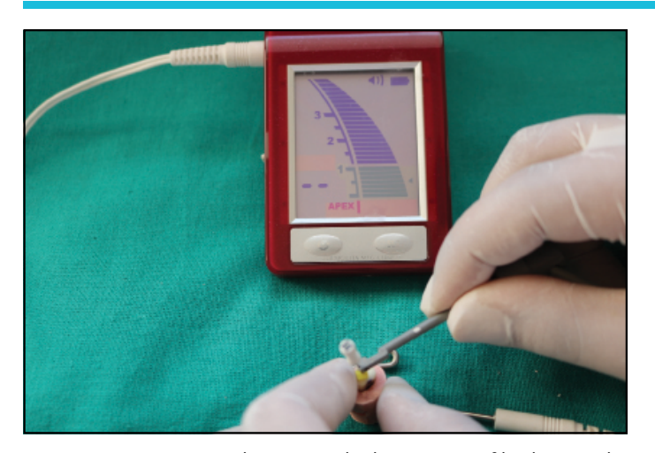
Figure 2. Root ZX mini device, attached to a 20 K-file showing the apex reading between "Apex-mark and 1-mark" on liquid crystal display (LCD)

near perforations. Rubber stopper was adjusted and the file was taken out from canal, and then electronic length (EL) were recorded up to the perforations in both the dry and wet conditions. Measurement of all teeth was done by the same experienced operator. Difference between ELs and the ALs was calculated. Clinically acceptable EL measurements was +/-0.5 mm of AL