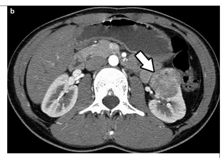
Figure 1. a, b. Pneumothorax in the right lung and cystic lesions having diffuse thin walls in both lungs in thorax high-resolution computerized tomography (a); angiomyolipoma in the left kidney in the abdominal CT (white arrow) (b)