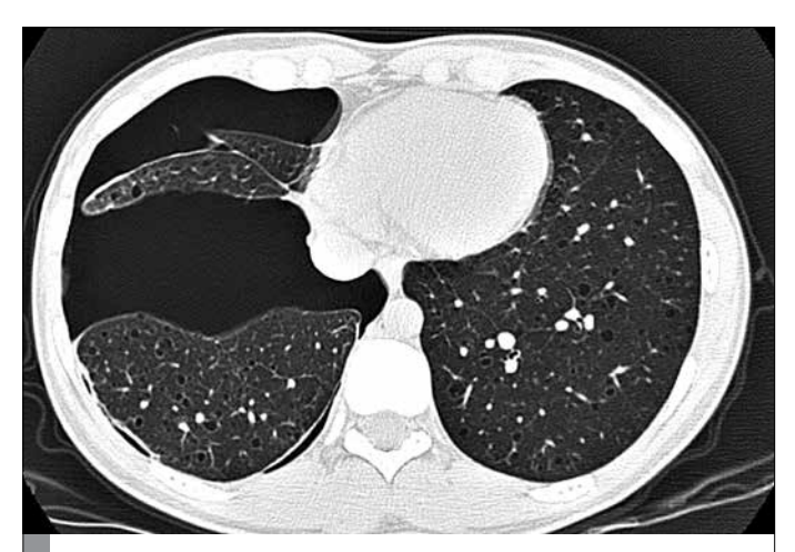
Figure 2. Pneumothorax in the right basal hemithorax and two-sided cystic lesions having thin walls in thorax high-resolution computerized tomography

completely after tube drainage. There was no significant regression of the patient's exertional dyspnea in the follow-ups at 3-month intervals. Forced vital capacity over the expected predicted values of pulmonary function tests was 86%, 82%, and 80%, and forced expiratory volume in 1 second was 84%, 81%, and 80%, respectively. In the same controls, decline of 48%, 46%, and 40% were observed, respectively, in carbon monoxide diffusion capacity of the lung. The patient applied to the emergency service with a complaint of right chest pain in the 11th month of the treatment. With the detection of pneumothorax in the subzone of the right lung in the chest radiography and thorax HRCT, tube drainage and pleurodesis were applied to the patient (Figure 2). When the present findings were evaluated, we decided to discontinue the treatment, considering that a positive response could not be obtained with progesterone treatment in the patient.