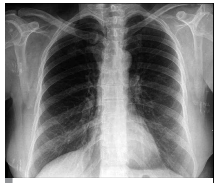
Figure 1. The postero-anterior chest X-ray of the patient showing a round nodule with indistinct margins, at the right upper zone

No abnormality was detected in the video bronchoscopic investigation of the patient and bronchoalveolar lavage fluid obtained from the right upper lobe revealed no malignant cells. In the positron emission tomography (PET), the SUVmax of the 15 mm nodule was reported to be 5.5, and there were no hypermetabolic lymph nodes or any