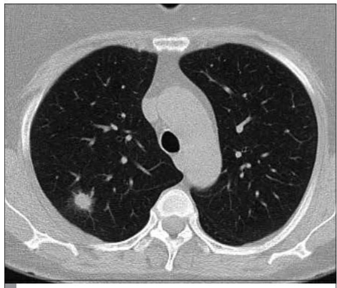
Figure 2. Computed tomography of the thorax (parenchymal window) showing a nodule with spiculated margins localized at the posterior segment of the right upper lobe