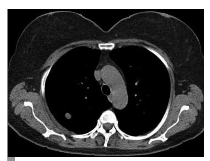
Figure 3. Computed tomography of the thorax (mediastinal window) showing a solid lobulated nodule

other foci. According to these findings, diagnostic intervention, CT-guided transthoracic fine-needle aspiration biopsy (FNAB) was performed. The cytological evaluation of the biopsy material showed inflammatory cells. As the FNAB results of the patient with a high probability of malignancy were not diagnostic, the nodule was removed by wedge resec-