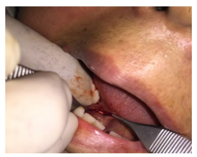
Fig. 2. Intraoperative stone in Wharton duct is seen.

Etiology and pathogenesis of salivary gland stones is still not understood generally (8). The severity of pain and swelling in salivary gland stones are related to the intra-duct pressure and the salivary flow varies according to the obstruction level. In our case, pain and swelling complaints were the most prominent. Salivary gland stones larger than