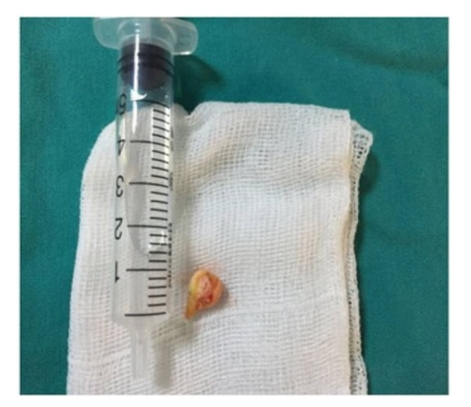
Fig. 3. The stone removed from Wharton duct is visualized.