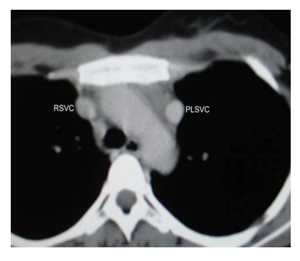
Fig. 3. Thoracic computed tomographic scan with contrast showing normal right superior vena cava (RSVC) and the left persistent superior vena cava (LPSVC).

The chest CT scan with contrast showed the normal right superior vena cava and the persistent left superior vena cava (PLSVC) as it drains into the right atrium after joining the coronary sinus (Figure 3). Also, an anatomic correlation between PLSVC and the left branchiocephalic vein was identified. Right and persistent left caval veins have almost equal size. There were not any other communications between right and left caval systems, and any abnormal left to right venous communications on CT scan. Normal position and structure of visceral organs was confirmed by abdominal ultrasonography.