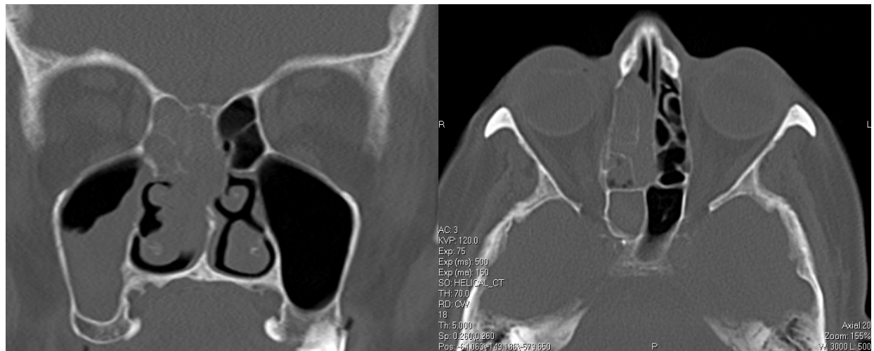
Fig. 1. CT paranasal sinus shows irregular soft tissue mass in the right ethmoid sinus extending anteriorly to frontoethmoidal recess, frontal sinus and posteriorly to ipsilateral sphenoethmoidal recess. (Left: Coronal cut, right: Axial cut).