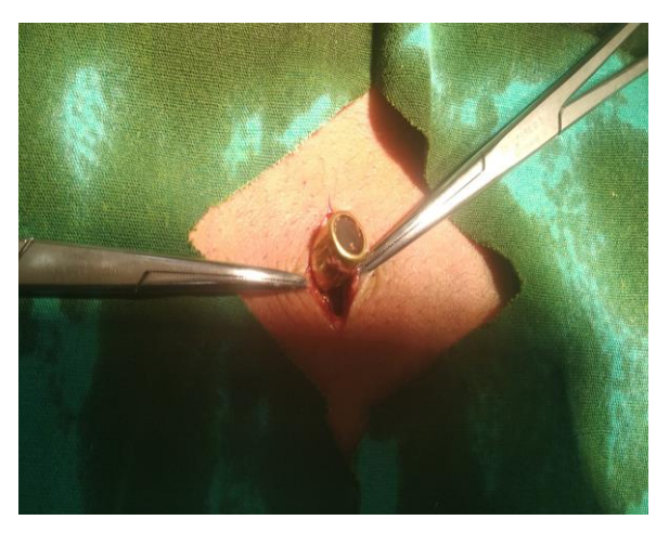
Fig. 3. The bullet during removal from chest wall

looking downwards located between ribs 2-3 anteriorly and was easily withdrawn (Figure 6). Hopefully the visceral and parietal pleura together with pulmonary parenchyme were found to be intact. Primary closure of the wound was performed. He had an uneventful postoperative recovery.