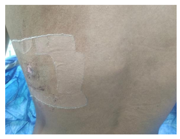
Fig. 1. The infant with a gunshot wound on the posterior wall of the left hemitorax. Note the indentation produced by the bullet close proximity to the left midline