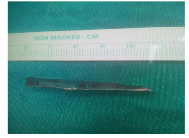
Fig. 6. The dagger-shaped glass after removal from chest wall

There are numerous factors affecting the decision of surgical management. Some of these are site of impaction, the extent of symptoms and possible risks of surgery inherent. The indications to remove these embedded FBs include serious hemothorax, refractor lung collapse, injury to other vital vascular structures and a bulbous mass with an umbiguous sort (6). Other indications of removal of retained FBs include sepsis, migration of the object and lead poisoning. In a recent study predictors for elimination of embedded thoracic foreign objects included wounds related to