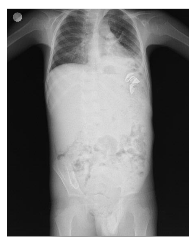
Fig. 1. x-ray