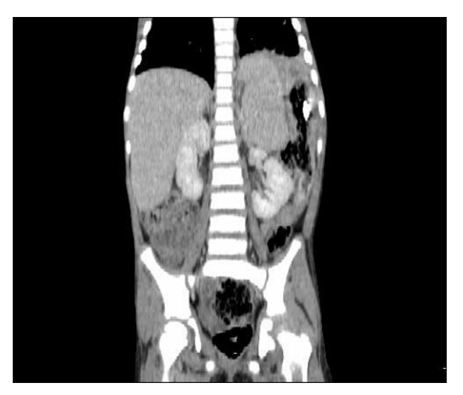
Fig. 3. CT scan shows colonic connection

Gossypiboma pathologically may result with inflammation and aseptic fibrinotic response as adhesion, encapsulation and granulation. It may also cause an exudative reaction with cyst or abscess formation (1,2). The fibrinous response can usually occur with palbable mass without clinical complaints, but it may also exert as fever and pain which are early symptoms of exudative form (1-3). Gossypiomas may