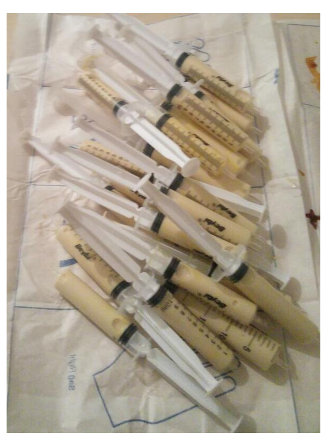
Fig. 3. Liquid from aspiration of galactocele with fine needle

Galactoceles may be visualized as a complicated cyst like lesion mimicking breast cancer or a heterogeneous mass with a pseudo-solid appearance containing hypoechoic and hyperechoic materials due to various amount of old milk, water and proteinaceous material. Nevertheless, they may suggest benign lesion with well-defined margins at Bmod US. 4). Elastography is a method of imaging based on tissue stiffness or hardness similar to clinical palpation with ultrasonography for malignancy. Elastography is a method for quantify stiffness unlike a physical examination that allows only the subjective judgment of the stiffness of a lesion (5). SWE has good diagnostic performance for distinguishing between malignant and bening breast lesions (6). The numeric values that distinguish soft and stiff tissue are designated as shear wave velocity (SWV). Most malignancies have stiffness but bening lesions such as cysts are typically soft. In our case the giant cystic lesion has high stiffness. In the present case, the maximum SWV was 9.93 m/s, which was similar to those of malignant lesions. In this case, high elasticity values were confusing. This result in the gigantic galactocele was associated with intense proteinaceous