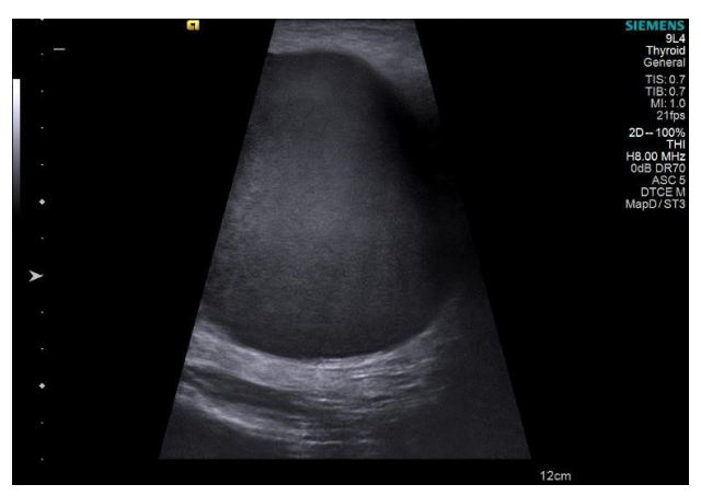
Fig. 1. Ultrasound examination of the breast reveals a hypoechoic giant cystic mass with regular margins