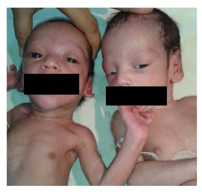
Fig. 2. Twin babies with hyper alert look and wide opened eyes.

Causes of congestive cardiac failure at birth usually occurs due to congenital heart disease like hypoplastic left heart syndrome (HLHS), severe tricuspid and pulmonary insufficiency and critical aortic stenosis etc (5). Perinatal asphyxia with