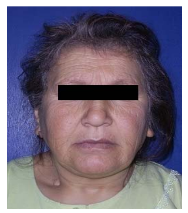
Fig. 1. The facial appearance of the patient is consistent with SS regarding GH deficiency and hypogonadism.

never made in follow. During one-year follow up, she had no complaints regarding hormone deficiencies or HN.