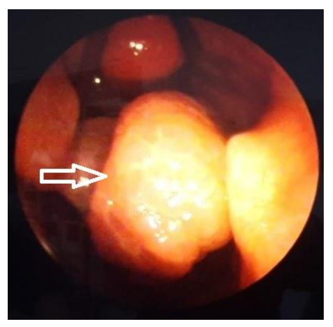
Fig. 1. Nasal endoscopy revealed degenerated inferior concha completely obstructing the passage on right side lying through the choana

A 67 years old male patient was admitted to our otolaryngology department suffering headache and hearing loss on right ear for 1 month. The otoscopic evaluation revealed otitis media with effusion on right ear. In nasal endoscopy, there was degenerated inferior concha completely obstructing the passage on right side lying through the choana and blocking the eustachian Audiometric tube (Figure 1). examination revealed right sided mixed type