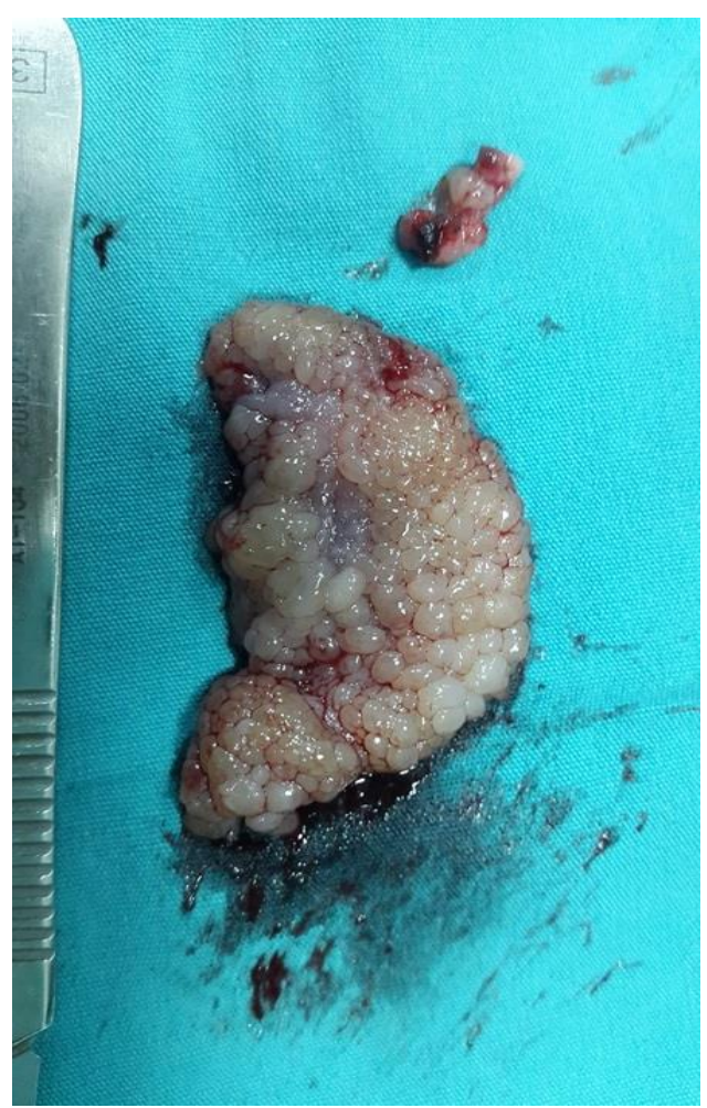
Fig. 4. Total excised material

maxillary sinus, lamina papyracea, cribriform plate and nasal septum in a 22 year old six month pregnant female; treated with trans-nasal endoscopic excision confirming cavernous hemangioma. In our case, although the lesion was large, the patient did not report any epistaxis. In that aspect, absence of epistaxis does not rule out the hemangiomas in differential diagnosis of lesions in nasal cavity. Moreover, to the best of our knowledge, our case is the first one presented with the hearing loss and serous fluid in middle ear.