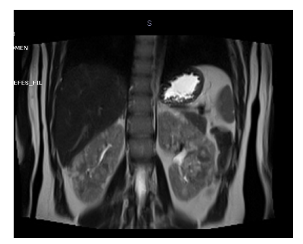
Fig. 3. Abdominal tomographic examination indicates the renal angiomyolipomas

Ultrasound scanning to detect renal complications of TSC is recommended in every 1-3 years and MRI study is beneficial in the suspicion of RCC (36,37).