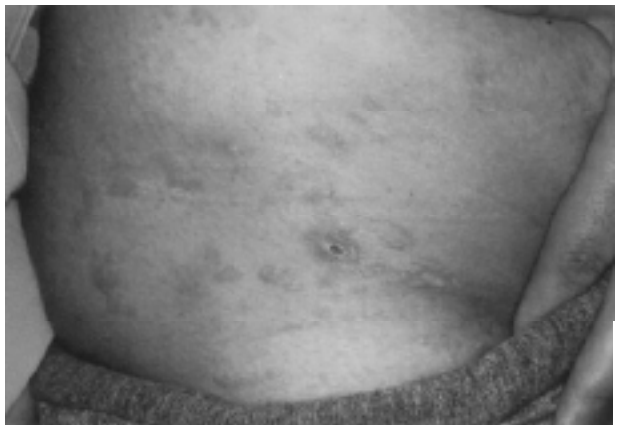
Figure 1. Skin-colored multiple papular and nodular lesions on the left lower back.

A 23-year-old woman was hospitalized for the evaluation of chronic urticaria. On the physical examination of the skin, we noticed firm, skin-colored multiple papules and nodules ranging from 0.2 to 1 cm in diameter in 16× 20 cm area of the left lower back (Fig.1). These lesions had been present for the last five years, and had increased in size. It was asymptomatic. The patient's general condition was good and all the laboratory findings were within normal limits. A skin biopsy specimen was obtained from the lower left back and stained with hematoxylin and eosin with a clinical diagnosis of