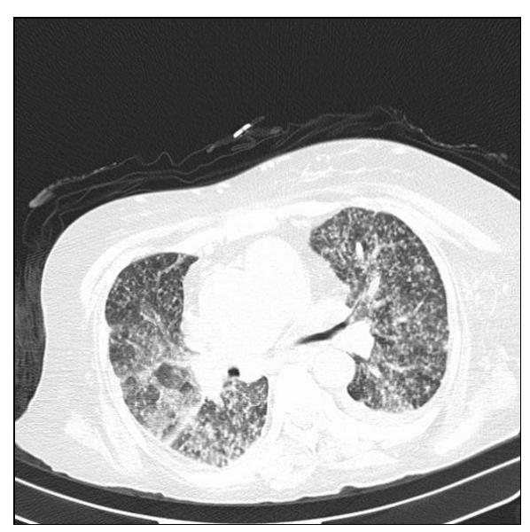
Fig. 1. Widespread sentriasiner nodules in both lungs and areas of ground glass opacities.

Thorax CT showed widespread centryacinar nodules in both lungs and areas of ground glass opacities. (Figure 1). The empirically diagnostic anti-TB therapy of isoniazid (INH) and rifampin (RFP), pyrazinamide (PZA), and ethambutol (EMB) was initiated.