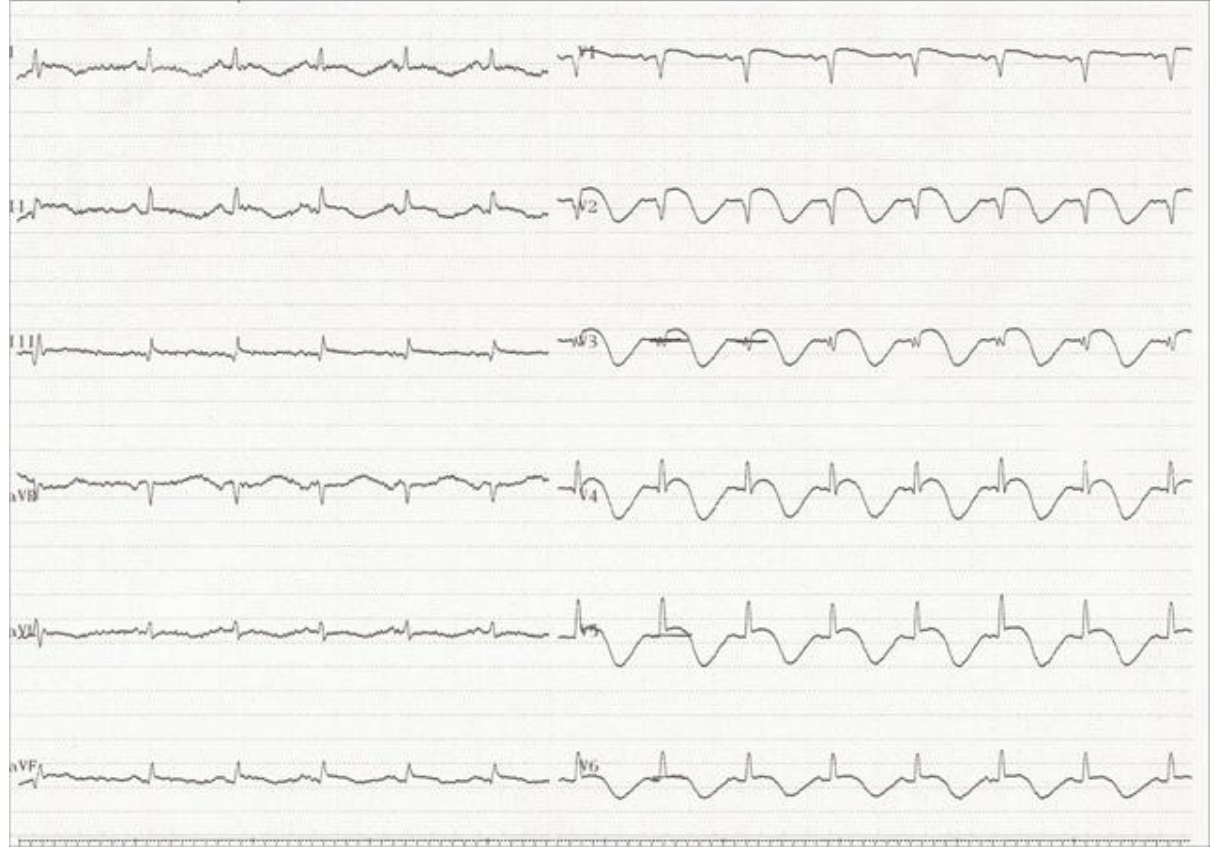
Fig. 3. ECG approximately 4-6 hours after primer PTCA.