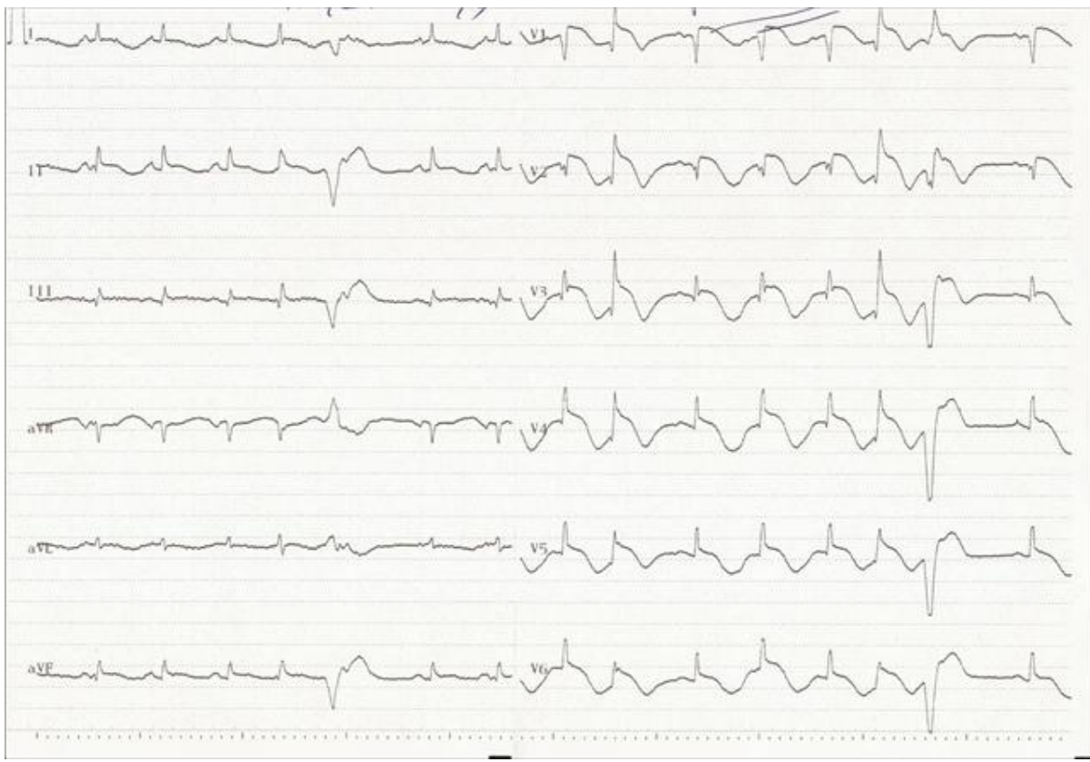
M. Tuncer et al / Acute occlusion due to secondary thrombocytosis

Fig. 1. ECG of the patient in emergency room