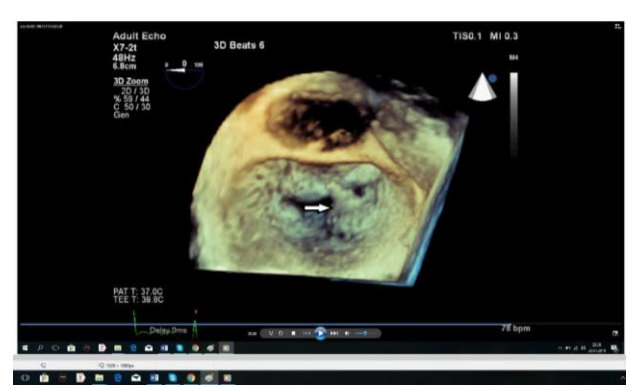
Fig. 3. Three-dimensional transesophageal echocardiography revealing a posterior leaflet prolapse (arrow marked)

premedication with midazolam (0.03 mg/kg) was performed and standard monitoring was provided with electrocardiography, pulse oximeter, invasive arterial pressure measurement and capnography. Two large peripheral venous routes were opened and blood samples were taken for basal arterial blood gas and activated coagulation time (ACT) measurements. External defibrillator pads were placed. A Vigileo Flotrac pulse counter invasive arterial cardiac output (CO) monitoring device was used for CO measurement. Heart rate (HR), blood pressure (BP), CO, stroke volume variance (SVV) and systemic vascular resistance (SVR) were recorded. General anesthesia induction was achieved with 0.05-0.1 mg/kg of midazolam, 0.5-1 mg/kg of ketamine, 5-10 µg/kg of fentanyl, and 0.8-1 mg/kg of rocuronium after preoperative oxygenation in all patients. The process was continued with patient state index (Masimo, Sedline, PSI) values between 25 to 50, 5 μg/kg/h fentanyl infusion, 50% oxygen air mixture, and 6% desflurane titration. After the induction of anesthesia, internal jugular venous cannulation was performed in the presence of ultrasonography (USG). The X7-2t TEE probe (Philips Medical System) was placed through the medial path by slightly lifting the mandible. TEE recordings were continued during the assessment