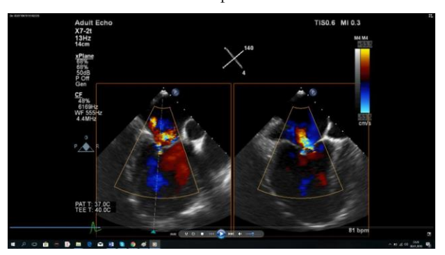
Fig. 8. First-degree residual block in the two-dimensional X-plane view after Neochord implantation (Figures 7 and 8), (Video 7,8).

Statistical Analysis: The distributions of the data were analyzed by the single sample Kolmogorov-Smirnov test. Numerical data were expressed as the mean and standard deviation (SD), and categorical data were expressed as number and percentage. Mean values of pre-induction, post-intubation, Neochord implantation, and exit HR, MAP, SVV, CO, and SVR were analyzed by the Kruskal-Wallis test; Tukey's honest significant difference test was used for posthoc analysis. Data were analyzed with Statistical Package for the Social Sciences, version 20 (SPSS Inc., Chicago, IL, USA). The statistical significance level was accepted as p<0.05 in all analyses.