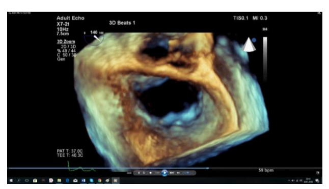
Fig. 7. The posterior leaflet mitral valve prolapse was invisible after Neochord implantation

the supine position, slightly right side, keeping the left arm over the head. Left anterolateral minithoracotomy was carried out through the 5th intercostal with a 5-6-cm vertical incision. The left ventricular apex was determined by palpation with the guidance of two-dimensional TEE and X-plan multiple imaging (Figure 4). Two pursestring sutures were placed with plegia to control bleeding. A total of 100 IU/kg of heparin was administered before ventriculotomy, which allowed the ACT to be 250-300 s. After transapical ventriculotomy, the Neochord DS1000 (Neochord, Inc., St. Louis Park, MN, USA) system was loaded with a polytetrafluoroethylene suture and advanced through the left ventricle. Xmid-esophageal long-axis commussural images were used to capture the ruptured chordae segment of the prolapsed leaflet (Figures 5 and 6), (Video 5,6). After the device entered the left ventricle, the purse-string was adjusted to reduce hemorrhage and allow the device to move back and forth. Under the guidance of TEE, contact with native chordae avoided, the Neochord lengths were set, and the was reduction in insufficiency was displayed