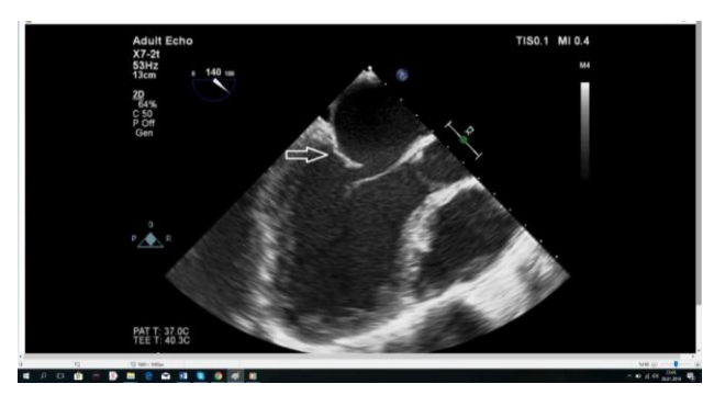
Fig. 1. Middle esophageal left ventricular long-axis image showing posterior mitral leaflet prolapses (arrow)