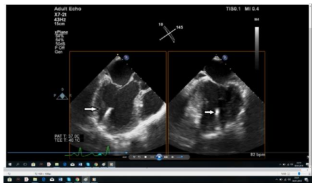
Fig. 5. Multiplan (X-plan) image of the mitral valve, showing the Neochord device moving in the left ventricle during placement of the Neochord