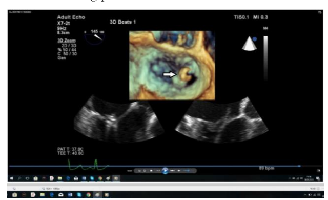
Fig. 6. Three-dimensional echo image of the Neochord device in the mitral valve orifice

Protamine sulfate was used for reversal of anticoagulation.