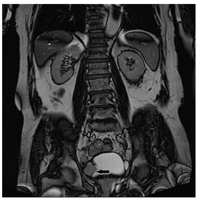
Figure 3: Coronal plane T2 weighted MRI image demonstrated 2 bladder diverticulae. The tumor was seen in the diverticula arising from right wall (arrow).