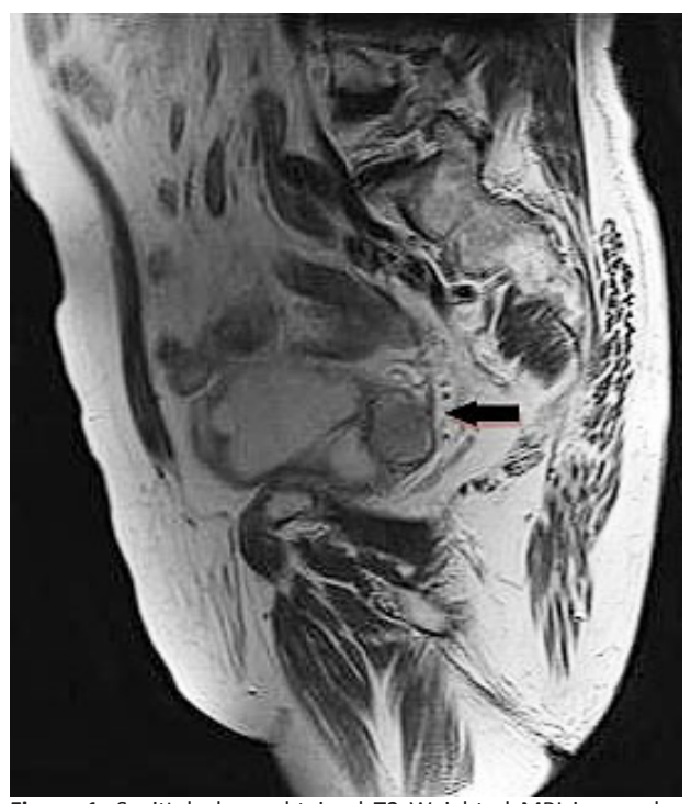
Figure 1: Sagittal plane obtained T2 Weighted MRI image demonstrated intradiverticular tumor arising from wall of the bladder (arrow).

MR images identified total number of three diverticulums, right and left-sided, posterolateral and anterior located, the largest one in the right posterolateral wall measuring 3 cm in the largest diameter (Figure 1). Diverticulum in the left posterolateral side and right anterior located was with no wall irregularities or filling defects which would point to the presence of neoplasm (Figure 2).