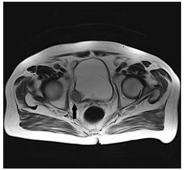
Figure 2: Axial plane T2 Weighted MRI image revealed an intradiverticular tumor arising from the right posterior wall of the bladder (arrow).