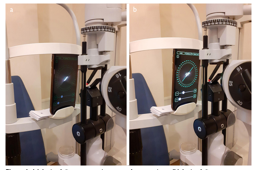
Figure 1. (a) Angle of slit as seen on the screen of a smart phone, (b) Angle of slit seen on a smart phone as measured with the Axis Assistant smartphone application (Centro Oftalmico Varas Samaniego, Guayaquil, Ecuador).

In the Callisto eye group, a reference image was taken with the IOLMaster 700 and the data were transferred to the Callisto eye image-guided system, which was already connected to an Opmi Lumera 700 surgical microscope (Carl Zeiss, Oberkochen, Germany). Live-stream images from the