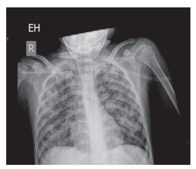
Figure 2. A repeat chest radiograph showing diffuse pulmonary infiltrates.

to decrease and he became tachypneic with a respiratory rate of 40 /min. A repeat CXR showed new diffuse pulmonary reticulonodular infiltration (Figure 2). Continuous infusion of acyclovir (2 mg/kg/day) was initiated, however the patient's clinical status deteriorated, fever and new infiltrations developed under acyclovir therapy, so vancomycin and cefepime therapy was added to the treatment regimen. The patient had respiratory failure and diagnosed as acute respiratory distress syndrome (ARDS) (Figure 3). Any pathogen could not be isolated from his blood and urine cultures.