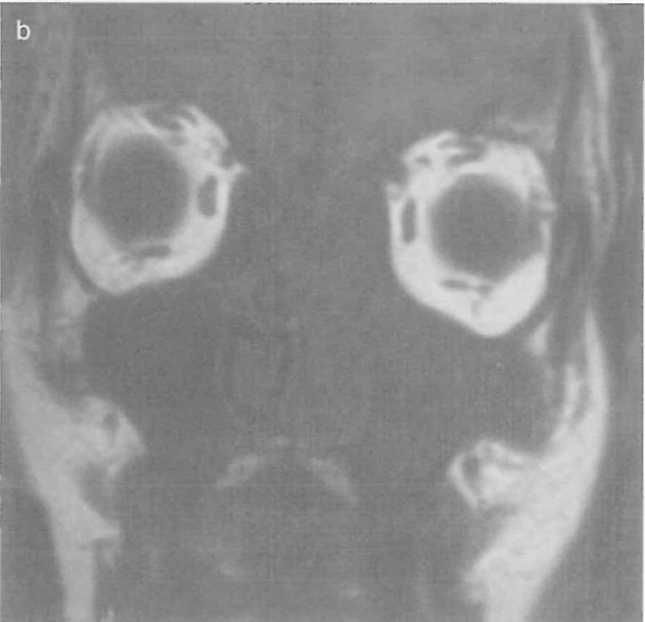
Figure 1. MRI of paranasal sinuses. Arrows show soft tissue mass, predominantly filling in the left nasal space on the coronal nects.

and cisplatin since he had intraabdominal LAP, liver and lung metastasis in the following days. However, he died because of progressive disease after 10 months of diagnosis.