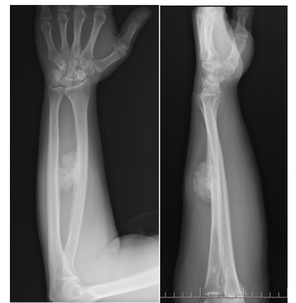
Figure I: Case 1, radius originated, irregular contoured mass lesion is seen on left forearm antero-postero-lateral direct radiography.

Marginal excision of the mas was performed. Histopathologic examination was compatible with periostitis ossificans. No recurrence or complication was seen at the follow-up for 36 months.