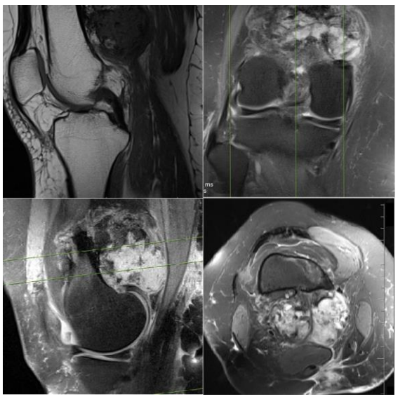
Figure III: Right knee Magnetic resonance imaging shows a lobulated contoured mass lesion which was isointense with the muscle on T1 sequences, and hyperintense compared to the muscle on T2 sequences.

Figure II: Case 2, Magnetic resonance imaging shows a smooth and lobulated contoured mass of 27x25x19 mm with contrast enhancement after gadolinium in the central section of the left forearm, which was isointense with the muscles on T1A sequences, hyperintense on T2A sequences, showing vicinity with radius central diaphyseal cortex, and exophytic growth to the soft tissue.