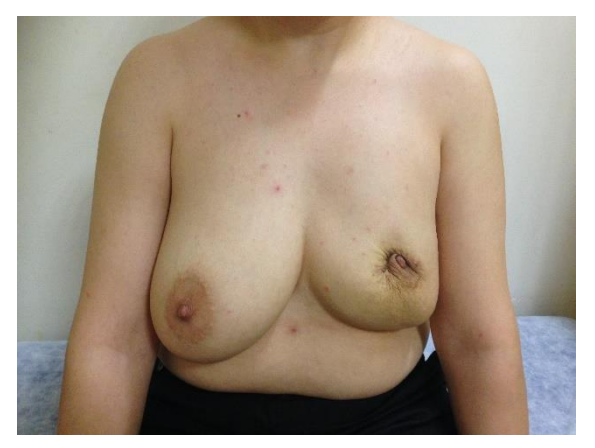
Figure 3: After the re-excision, the cosmetic results of patient