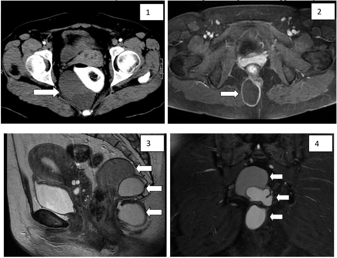
Figure 1: Right perirectal tail gut cyst. There was no obvious communication between the cyst and rectum and no bony destruction of the coccyx (postcontrast abdomen CT image). Figure 2: Infracoccygeal hypointense cystic lesion (axial postcontrast fat sat T1-weighted MRI image). Figure 3: Presacral, precoccygeal and infracoccygeal hyperintense cystic lesions (sagittal T2-weighted MRI image). Figure 4: Presacral, precoccygeal and infracoccygeal hyperintense cystic lesions (coronal fat sat T2-weighted MRI image).

mucoid contents which were lined by columnar