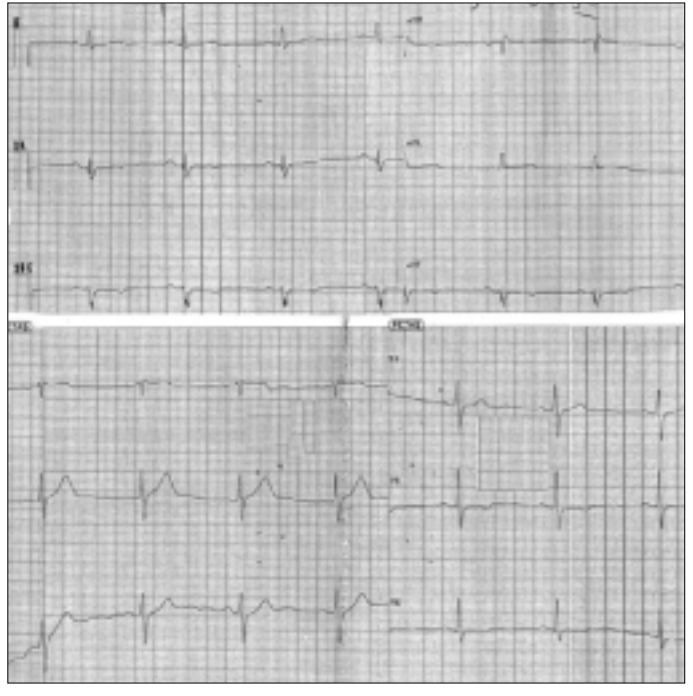
Figure 1. Admission electrocardiogram shows negative T waves in leads V5-V6 and inferior derivations

He is still on follow-up for 34 months. Despite the persistent myocardial ischemia in inferolateral region, he has not experienced any major cardiac event or angina both at exercise and at rest.