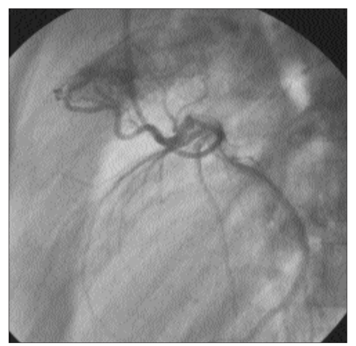
Figure 1. Fistula between the left main coronary artery and the pulmonary artery

tula, distal localization of the drainage orifice and absence of concomitant organic heart pathology, embolization may be an appropriate technique. In the absence of stenosis, proximal or lateral localization of the drainage orifice, presence of several drainage orifices, a large aneurysm of an anomalous coronary artery, especially localized distally, single coronary artery and