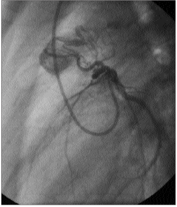
Figure 3. Control angiography after 20 minutes shows residual flow (after implantation of first coil)

concomitant organic heart disease exist, embolization may be difficult and the risk of complication is high. In such circumstances, if possible benefits and risks should be weighed; the choice of routine surgical treatment would be less risky. Of course, surgeon's experience plays an important role in this choice. Coil embolization of the fistula ought to be made dis-