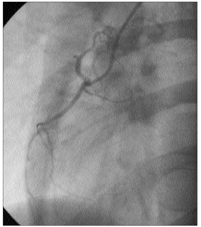
Figure 2. Fistula between the right coronary artery and the pulmonary artery

concomitant organic heart disease exist, embolization may be difficult and the risk of complication is high. In such circumstances, if possible benefits and risks should be weighed; the choice of routine surgical treatment would be less risky. Of course, surgeon's experience plays an important role in this choice. Coil embolization of the fistula ought to be made dis-