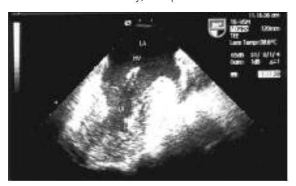
Figure 1: "Seagull wing" mitral valve appearance at transesophageal echocardiography.

A 34-year old man was referred for cardiology examination because of chest pain that was present for 3 years. The pain, burning, stubbing in character, was unrelated to effort and it was radiating toward right arm and backward. Physical examination was normal, except for a soft, short grade 1/6 systolic murmur heard at mesocardiac area. Chest X-ray, complete blood count and biochemical analysis were normal. Electrocardiogram sho-