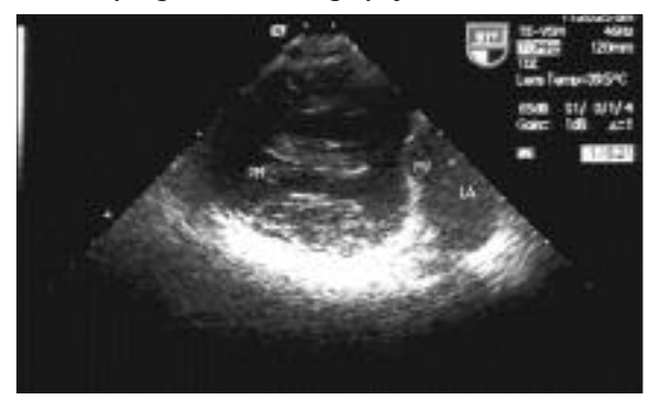
Figure 2: Transesophageal transgastric short axis view of four papillary muscles.

wed sinus rhythm and incomplete right bundle branch block. On treadmill exercise (modified Bruce protocol) he achieved 9 MET's without any symptoms and associated ST-segment depression.